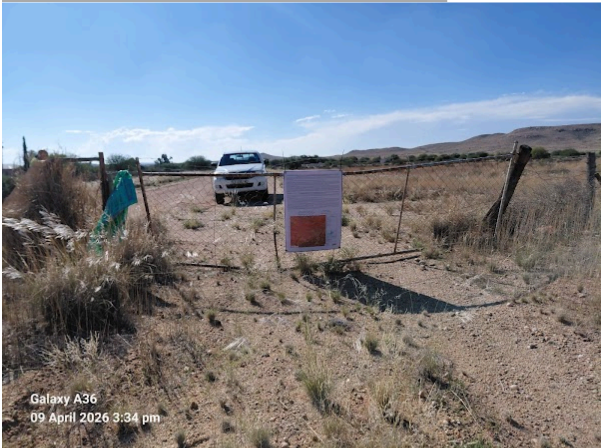
Site Notice 6

A1 Notice: 09/04/2026 15:34:00; GPS Coordinates: -29.316091, 19.547792