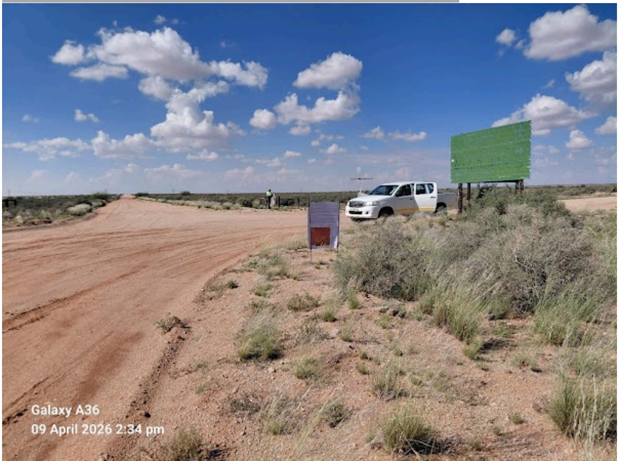
Site Notice 1

A1 Notice: 09/04/2026 14:34:00; GPS Coordinates: -29.400042, 20.115953