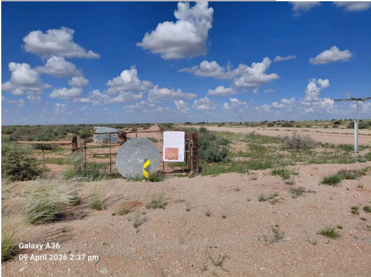
Site Notice 2

A1 Notice: 09/04/2026 14:37:00; GPS Coordinates: -29.399847, 20.116245