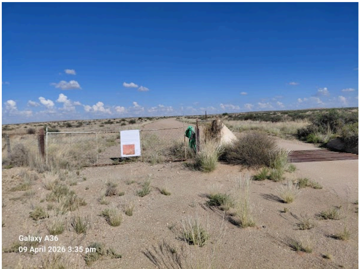
Site Notice 7

A1 Notice: 09/04/2026 15:38:00; GPS Coordinates: -29.314484, 19.546589