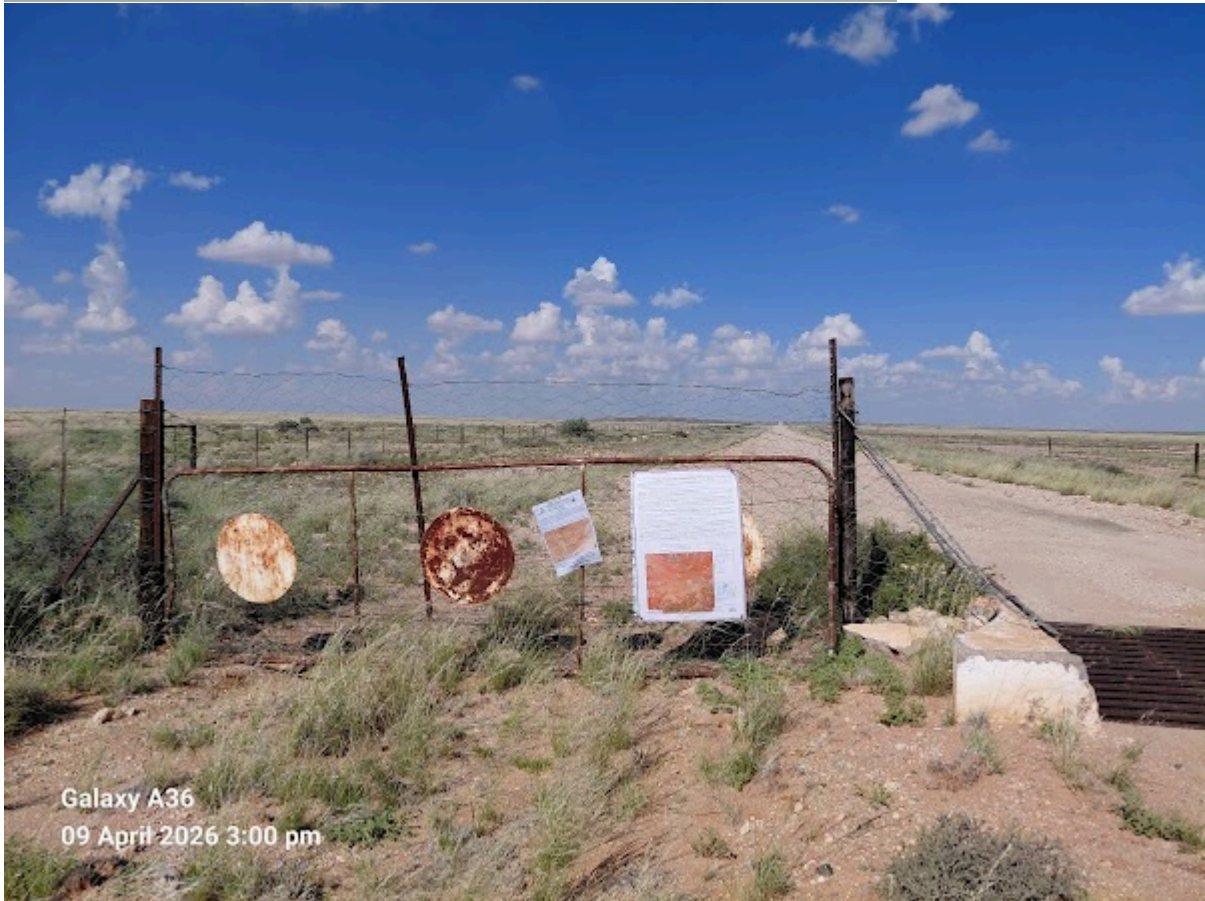
Site Notice 5

A1 Notice: 09/04/2026 15:00:00; GPS Coordinates: -29.336381, 19.954895