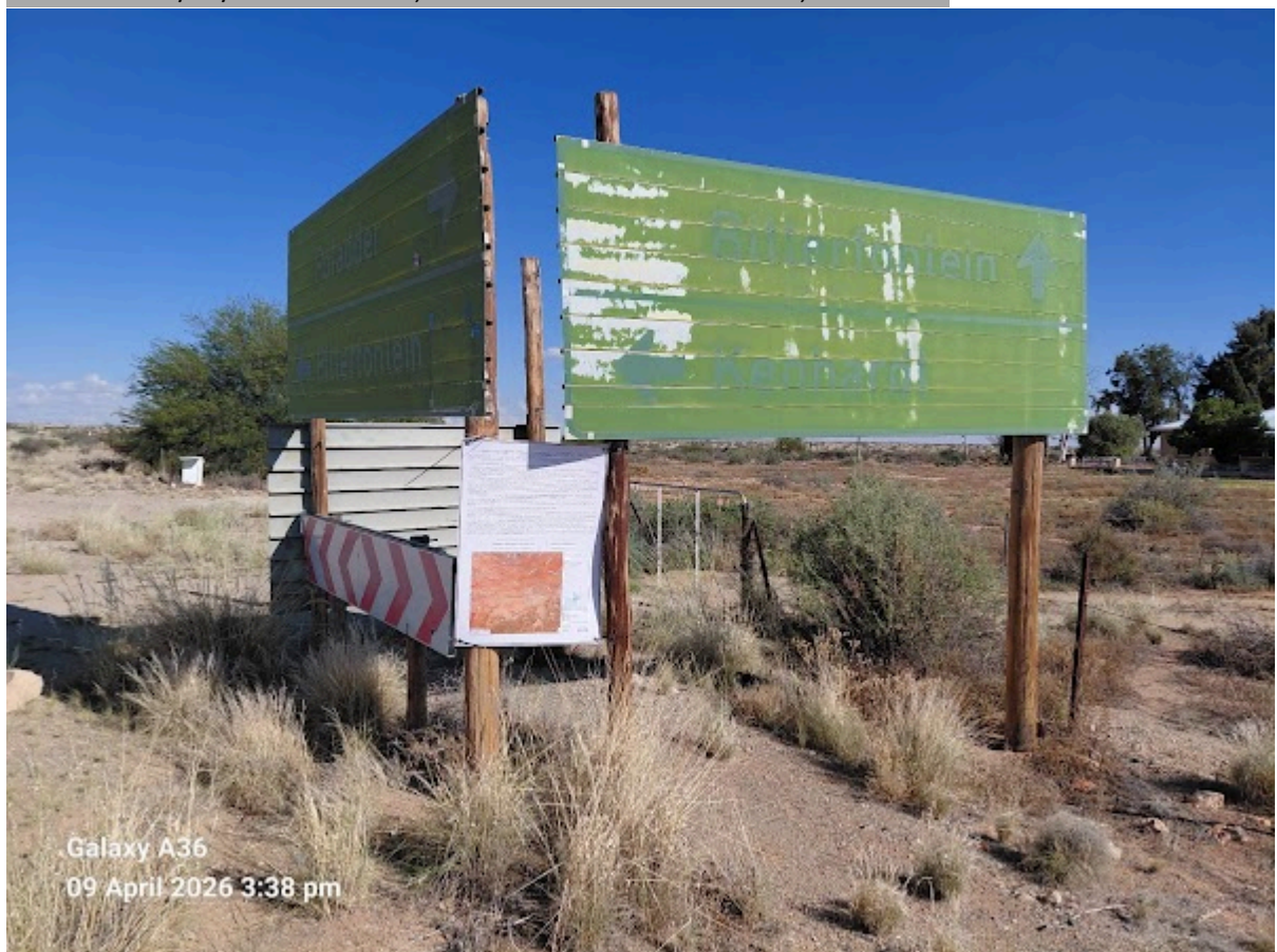
Site Notice 8

A1 Notice: 09/04/2026 15:38:00; GPS Coordinates: -29.314484, 19.546589