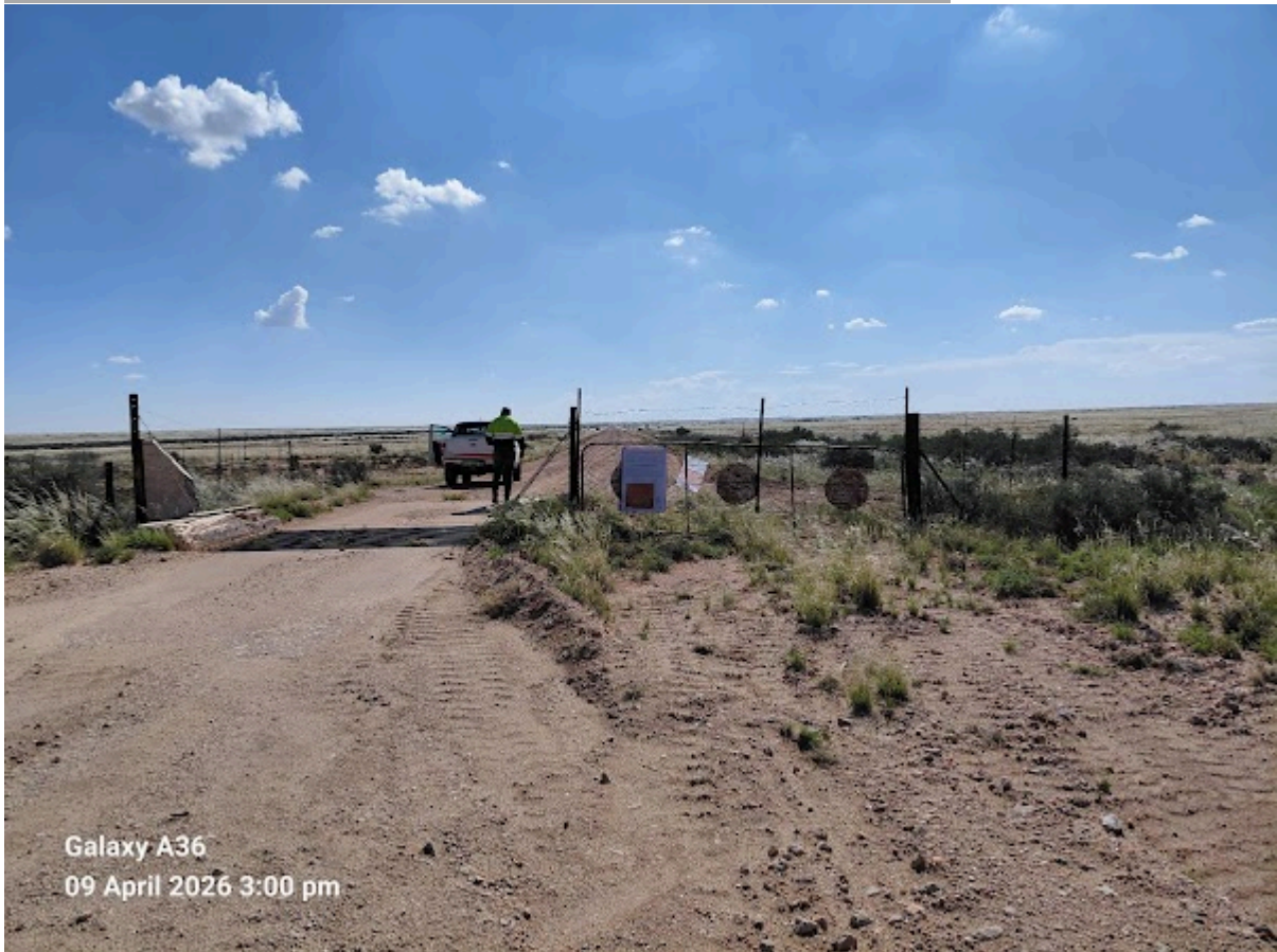
Site Notice 4

A1 Notice: 09/04/2026 15:00:00; GPS Coordinates: -29.336452, 19.955030