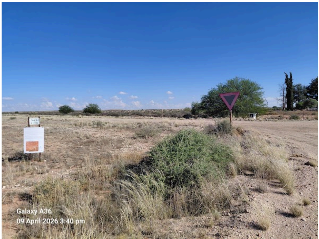
Site Notice 9