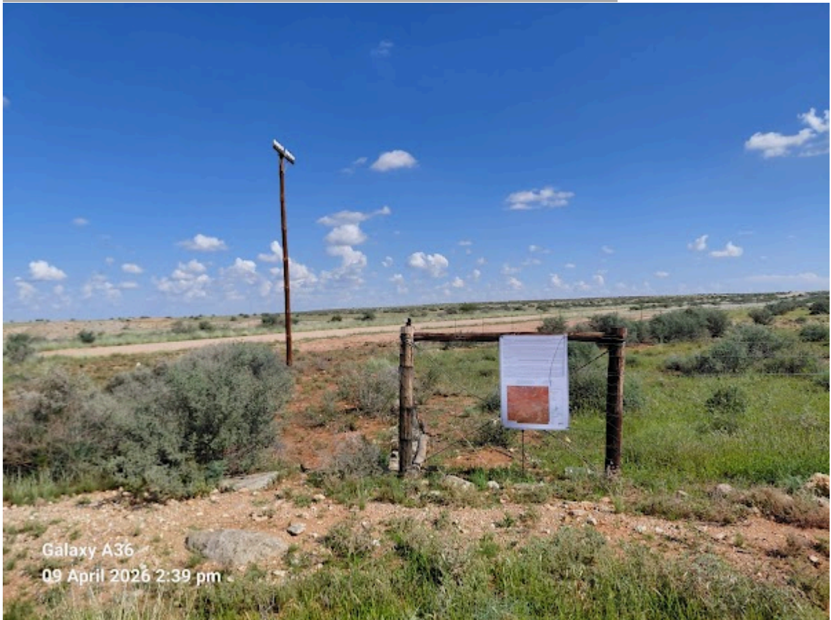
Site Notice 3

A1 Notice: 09/04/2026 14:27:15; GPS Coordinates: -29.399775, 20.115692